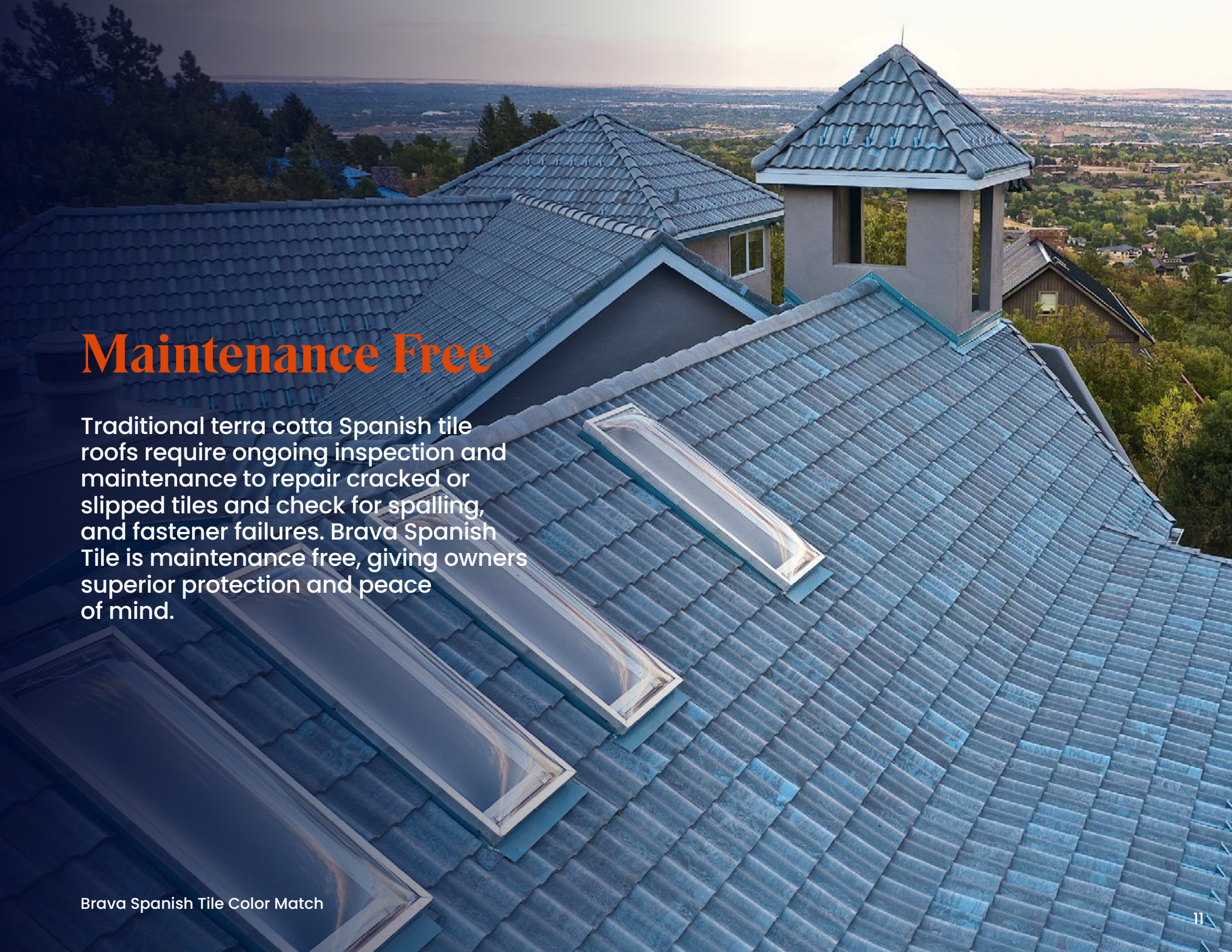
Brava Spanish Tile Color Match

Traditional terra cotta Spanish tile roofs require ongoing inspection and maintenance to repair cracked or slipped tiles and check for spalling, and fastener failures. Brava Spanish Tile is maintenance free, giving owners superior protection and peace of mind.