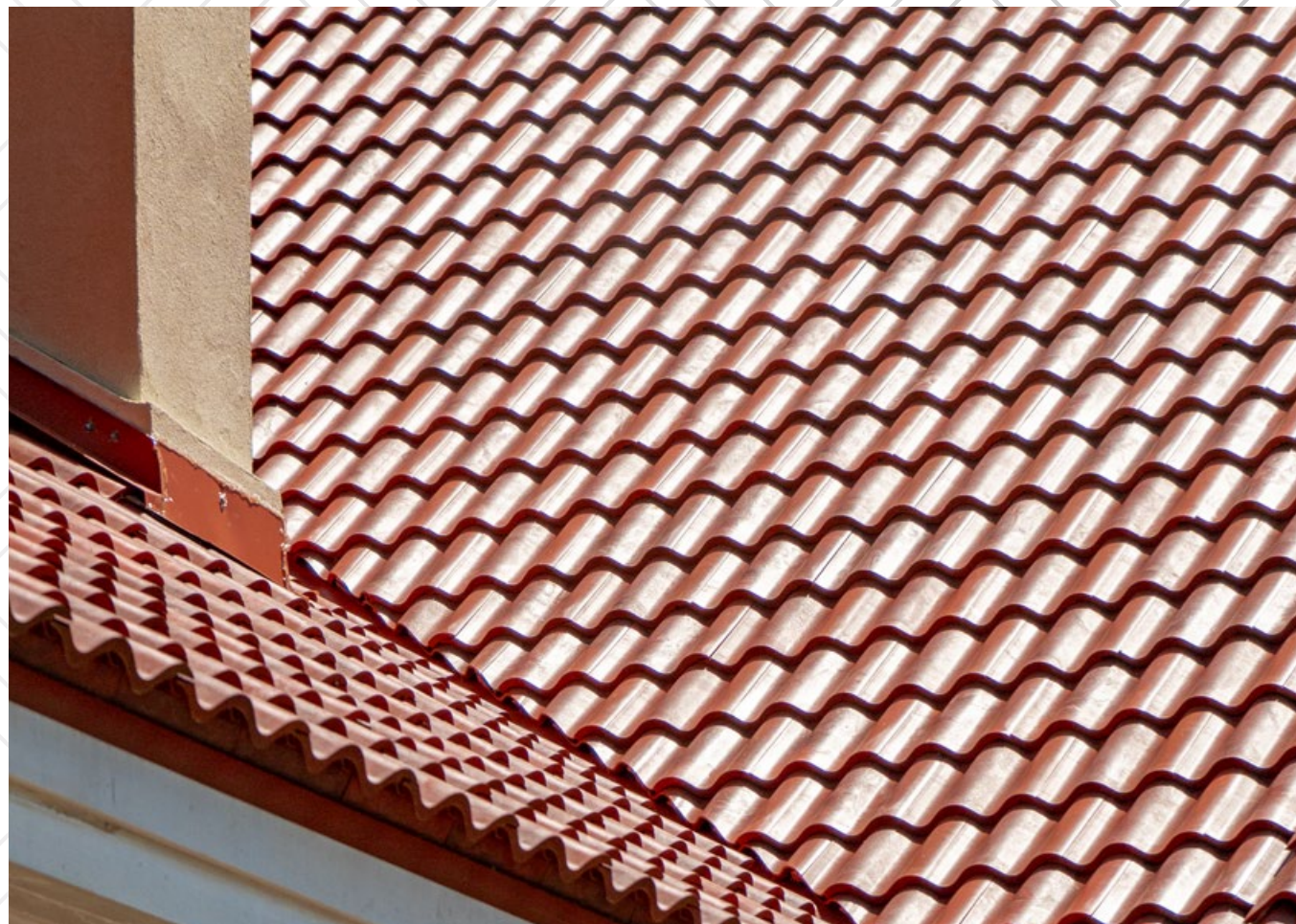
Brava Spanish Tile Tuscan

Brava uses state-of-the-art compression molding technology. It's this precision of manufacturing that gives Brava Spanish Tile its unparalleled strength.