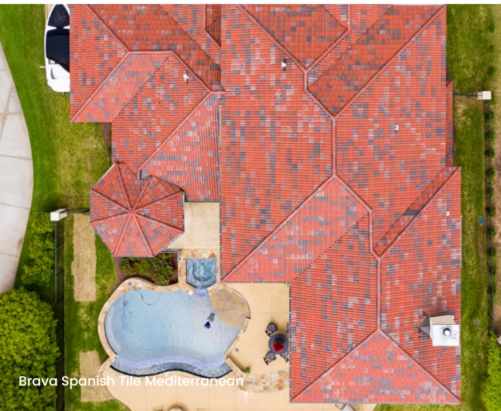
Brava Spanish Tile Mediterranean

"We get a lot of mold in South Florida. We will never have that issue with Brava. It is close celled. It doesn't consume the water and collect mold."