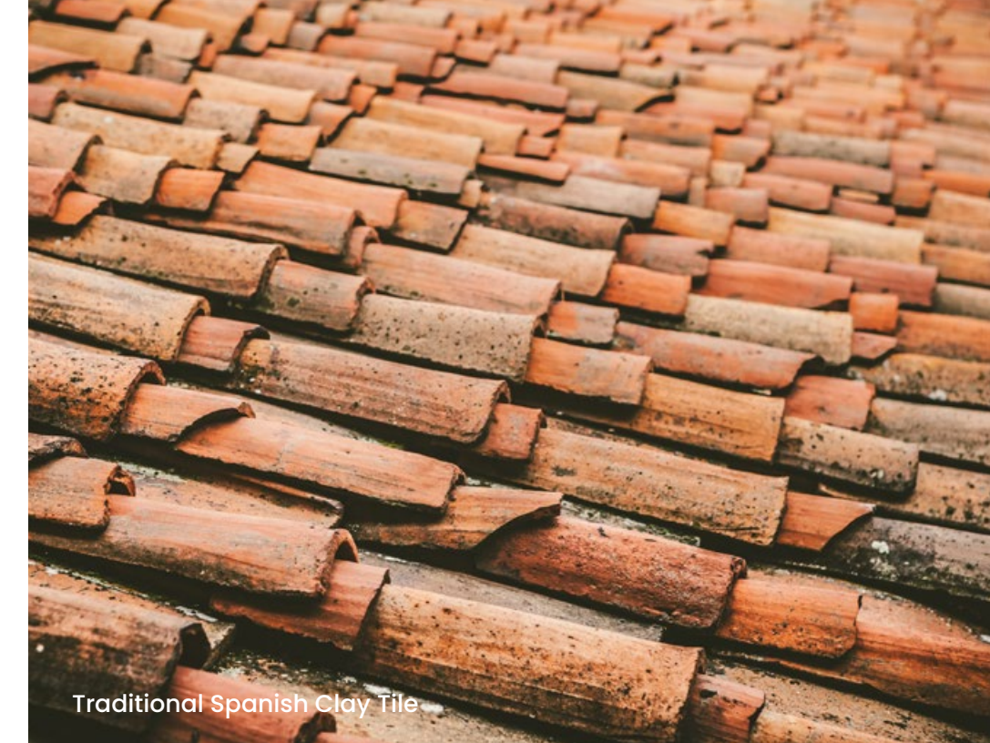
Traditional Spanish Clay Tile

Traditional clay tiles create a surface with depth and shadow that's rich with dappled color.