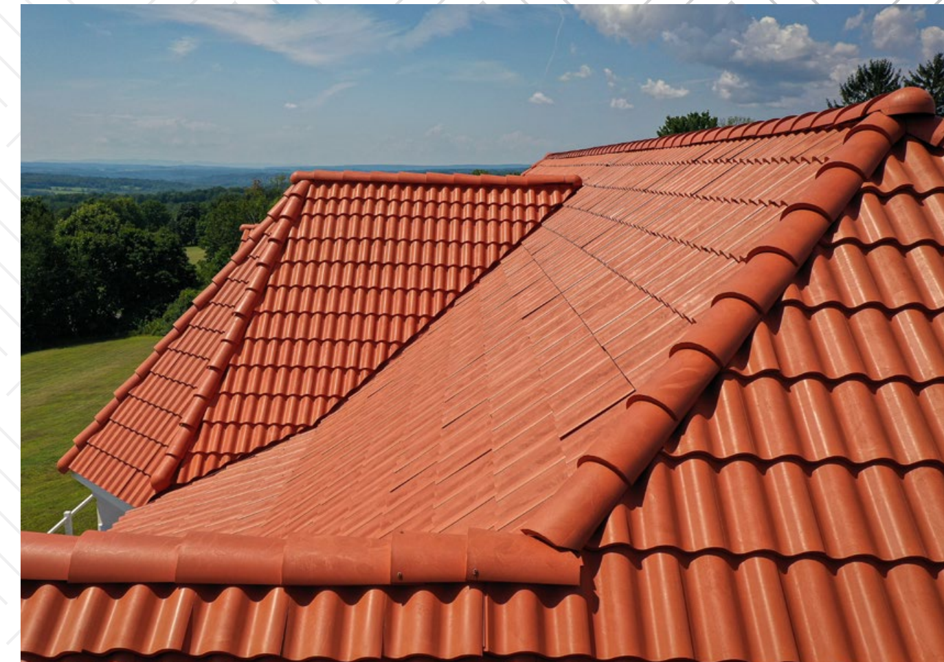
Brava Spanish Tile French Clay

Brava uses the most advanced UV protection to guarantee superior, long-lasting color.