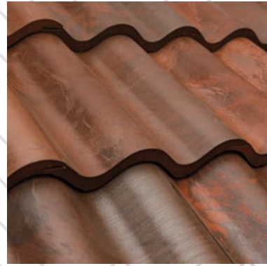
NEW-AGED TERRA COTTA