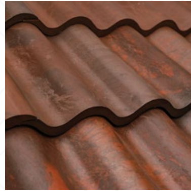
TERRA COTTA BROWN